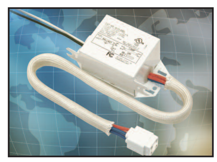
PLUG FOR CIRCLINE LAMPS